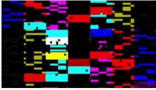
Bars & Tone