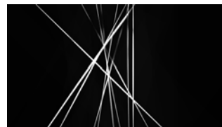
String of Sound